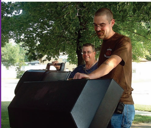
Vesper Fire Department Brat Fry

Community Progress is all about improving our communities, now and for the future. You can help build a strong Vesper Area community for many generations to come – by making contributions to the Vesper Area Progress Fund.