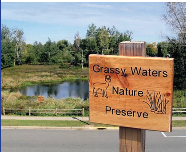
Grassy Waters Nature Preserve

Community Progress is all about improving our communities, now and for the future. You can help build a strong Nekoosa Area community for many generations to come – by making contributions to the Nekoosa Area Progress Fund.